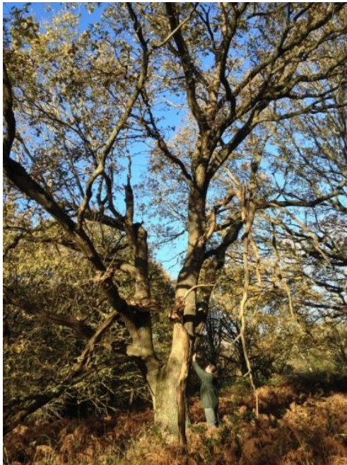
Epsom Common LNR veteran tree survey work

Heritage Asset, or its wider setting, will be required to provide an assessment of the Asset, the potential impacts on the Asset and any appropriate mitigation measures that will be required. In 2017 the initial process of mapping potential veteran trees across the Borough, was completed. The eventual aim is to provide a comprehensive inventory of veteran trees to help ensure their retention as 'Heritage Assets'.