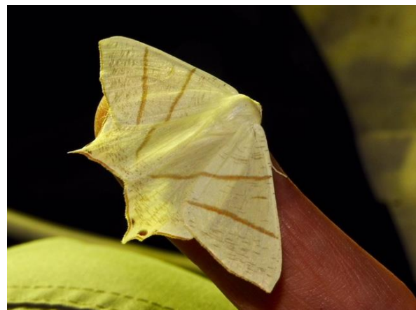
Horton Country Park LNR, Swallow-tailed moth ( Ourapteryx sambucaria ) summer