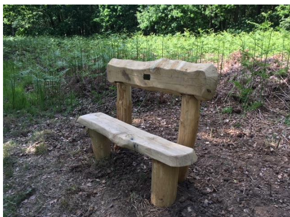
The completed bench!