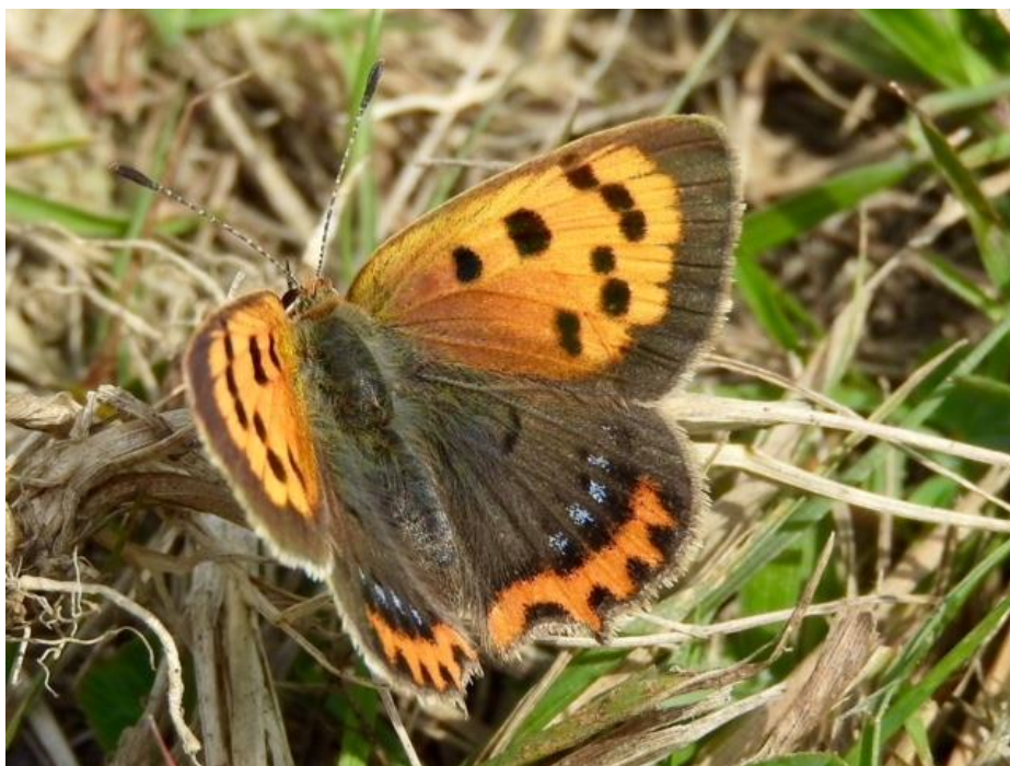
Epsom Common LNR Small Copper butterfly in Great Pasture summer 2016

Update:- The Countryside Team and volunteers continued to monitor butterflies on a weekly basis over the summer using agreed transects and submitting records to the national database for Epsom Common LNR, Horton Country Park LNR, Hogsmill LNR, Nonsuch Park, Howell Hill Nature Reserve and Juniper Hill. 2017 has turned out to be an average year with a warm spring bringing an early start but a damp end of July and August affected some species.