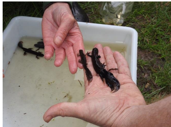
Photo taken at Blakes Pond on Epsom common LNR shows the difference in size between the Smooth Newt and the Great Crested Newt spring 2016

During 2017 Pete has received and input bat records from the Surrey Bat Group, planning applications and local nature reserves surveys using the