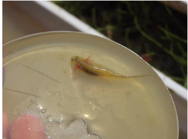
Newt eft found in the new balancing pond in Horton Country Park LNR

New: During September 2017 'Field Pond' in Horton Country Park LNR was part de-silted by the Lower Mole Partnership using funds provided by the Lower Mole Trust and Friends of Horton Country Park. In recent years 'Field Pond' has been successfully protected from dogs by a fence (See report under Objective 4) and EEBC Countryside Team volunteers have cut back over shading vegetation in preparation for de-silting. The pond is being closely monitored and the expectation is that its spectacular revival of recent years will be consolidated.