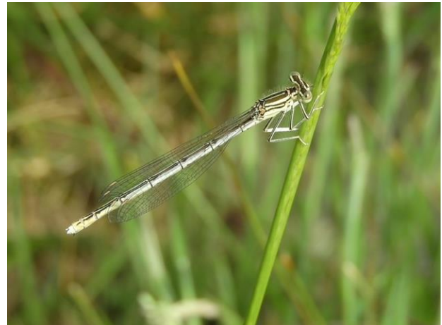
Epsom Common LNR a White Legged damselfly in Rye Meadow June 2017

New: A bird survey carried out at Priest Hill Nature Reserve identified 79 bird species indicating the sites importance as bird habitat.