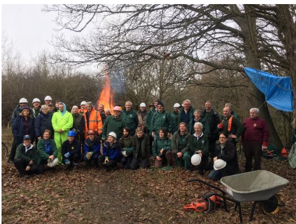
Volunteers from Ashted Common, Lower Mole Partnership and EEBC Countryside Team at the 2017 Epsom & Ashted Commons Joint Task January 2017

Update:- EEBC continues to strongly support local groups actively involved in conserving and enhancing biodiversity within the Borough. For example, the Epsom Common Association, Nonsuch Voles and the Lower Mole Partnership (LMP), formerly the Lower Mole Countryside Management Project. The name change reflects changes made following a review of the Surrey Countryside Management Projects. There is now one board overseeing the work of the Lower Mole, Downlands and Heathlands Partnerships with EEBC continuing to be a funding partner in the Lower Mole Partnership. The EEBC Countryside Team has continued with a weekly volunteer conservation task held on Thursdays, during 2017, 409 volunteer days were recorded, carrying out practical conservation work closely aligned to the LBAP which has a value of approximately £22,495 using the Heritage Lottery valuation of unskilled volunteer work at £55 per day per volunteer (Please note some work is classed as skilled and could command a higher value of £100 per day per volunteer)