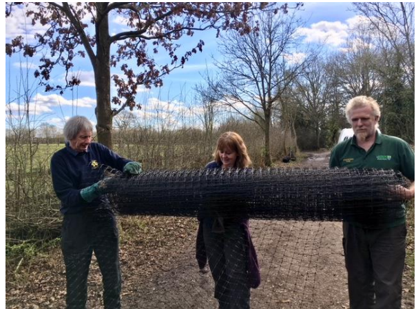
Beside Four Acre Wood in Horton Country Park LNR, EEBC Countryside Team volunteers rolling up the retrieved Tenax mesh for future deer fencing winter 2017

In 2015 for the first time since Lower Mole Partnership volunteer's recommenced restorative coppicing in Butcher's Grove in 1983, coppicing was carried out by a woodsman at no cost to EEBC. After 30 years of volunteer effort the value of the coppiced Hazel is now high enough to cover the woodsman's cost of coppicing, however it should be noted that the cost of deer fencing to ensure future coppice has to be covered by grant aid and installed by volunteers. Sadly in 2017 whilst coppicing in Butcher's Grove took place the woodsman is now no longer active in Surrey. The search for a new woodsman will continue so that our volunteers can carry out other vital nature conservation work.