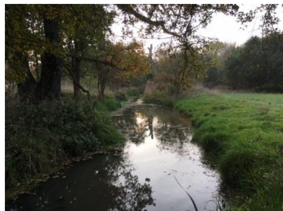
Horton Country Park LNR Lambert's Pond the long lost arm of the pond de-silted by the Lower Mole Countryside Partnership volunteers autumn 2015 and autumn 2016