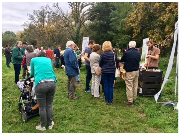
Horton Country Park LNR Lambert's Orchard members of the public enjoying Apple Day October 2017