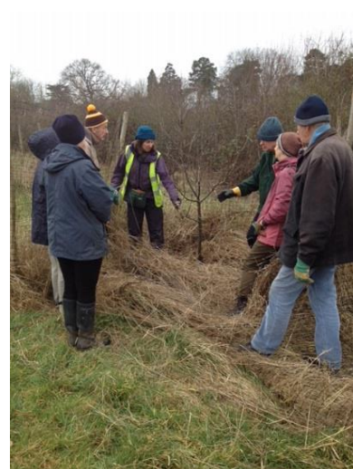
Horton Country Park LNR volunteer's receiving training from the London Orchard Trust in Lambert's Orchard February 2017