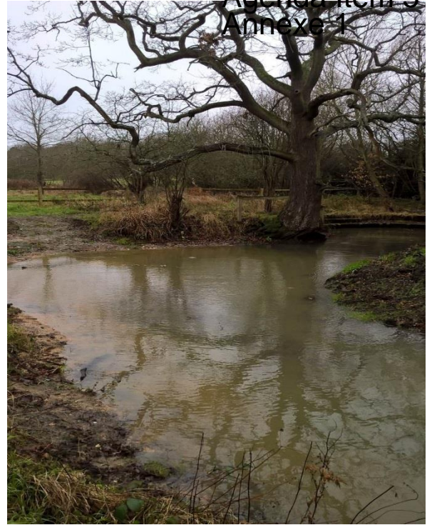
Field Pond in Horton Country Park LNR shortly after de-silting and again in December 2017

New: During 2017 the Friends of Rosebery Park in Epsom paid for the installation of bat boxes in several trees hoping to provide increased summer roosting habitat for the Pipistrelle bats that are present in the park.