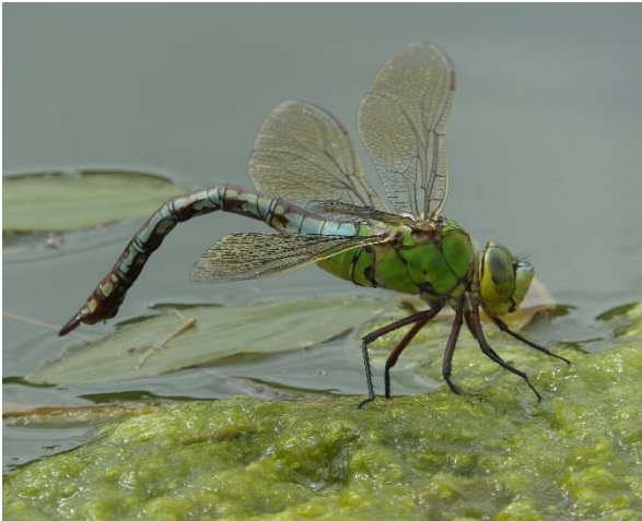
Emperor dragonfly laying eggs in the new wetland in Horton Country Park LNR