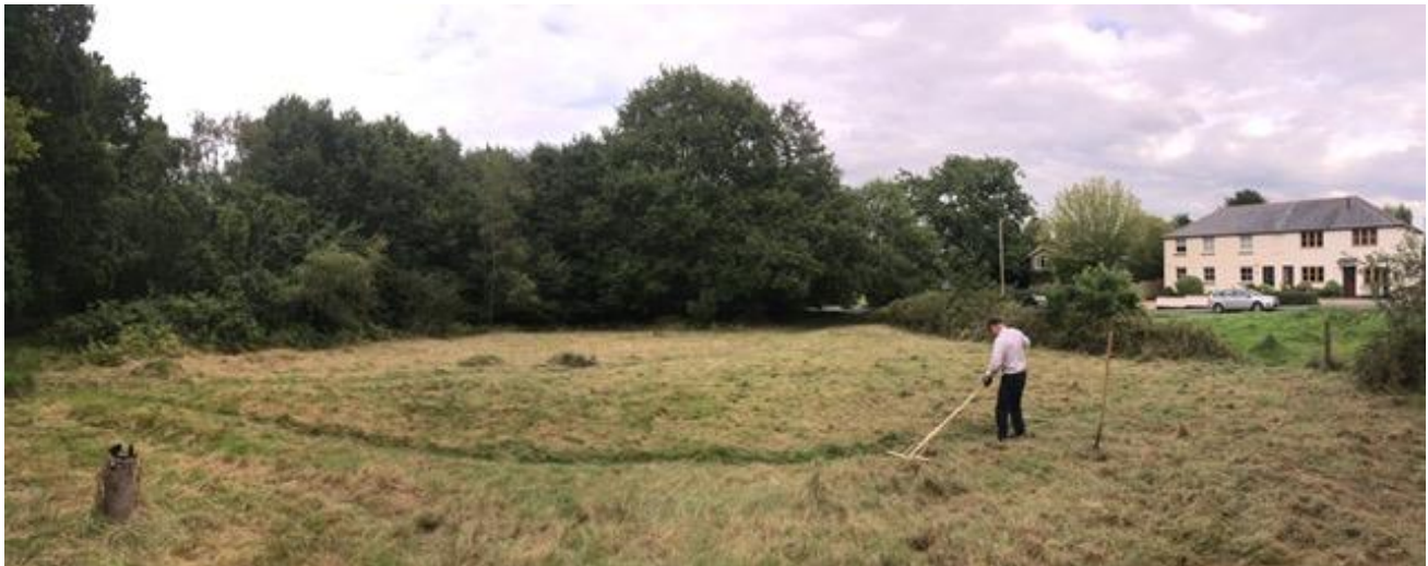
Epsom Common LNR Churchside Meadow, EEBC Countryside team volunteer raking in cut August 2017

Update:- In 2012 EEBC and the City of London paid jointly for a National Vegetation Class (NVC) survey of Epsom and Ashted Commons as a follow up to the 2001 NVC survey. The survey highlighted the progress made in diversifying habitats especially through the re-introduction of grazing. However, the report also highlighted the continuing loss of areas of species rich grassland to scrub encroachment. To address this the Countryside Team Volunteers commenced a restoration programme during late summer 2013 which is continuing with the aim of both restoring areas and ensuring long term maintenance. This process was continued in 2017 with volunteer's returning to Churchside Meadow, Christchurch Glade, Baron's Meadow and Railway Meadow.