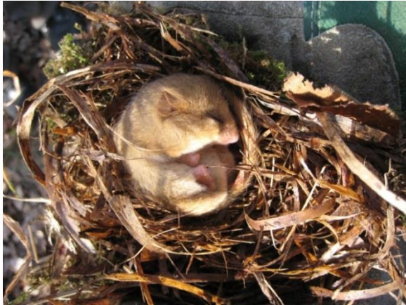
The Dormouse found on Epsom Common LNR february 2012

Common, however a dormouse was found in a box in Pond Wood in Horton Country Park. This result and a confirmed presence on Ashted Common in 2017 is informing the future management of our woodland and efforts to monitor their presence using boxes and tubes will continue during 2018.