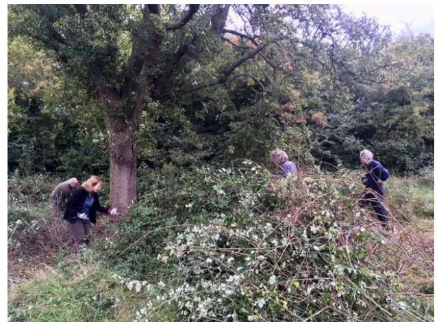
Horton Country Park LNR in Lambert's EEBC Countryside volunteers clearing scrub around a pear tree prior to mulching September 2017