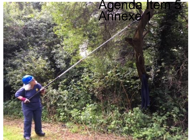
Agenda Item 5 Annexe 1 Countryside Team Volunteer using a pole saw to cut back an over shading branch on the Hogsmill LNR summer 2017

Update:- During 2014 the Woodland Trust purchased a very large area of land at Langley Bottom Farm to create a First World War memorial woodland. This is a major initiative for the Trust who now have a memorial wood in England, Scotland, Wales and Northern Ireland. The farm is partly in the Boroughs/Districts of Epsom & Ewell, Mole Valley and Reigate & Banstead. The initiative will protect and hopefully enhance the biodiversity of this land in perpetuity. The Trust has held public consultation events for local residents and has consulted with EEBC and neighbouring districts. In 2015 the Trust were informed by the Forestry Commission that an Environmental Impact Assessment (EIA) was required due the scale of the tree planting proposals. Similarly an EIA has also been requested by the three district planning authorities (Epsom & Ewell, Mole Valley and Reigate & Banstead) for the car parking and visitor centre proposal. Following the successful completion of the EIA the Trust recommenced tree planting in 2017 following guidelines that ensure a balance is maintained between new woodland and areas retained as either arable fields to conserve rare arable plants and bird nesting habitat or grazed fields to conserve calcareous grassland.