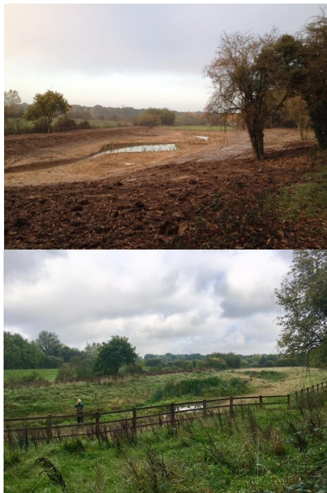
New balancing pond in Horton Country Park LNR just after construction January 2016 and September 2017

Update:- During the Autumn of 2015 Horton Country Park Local Nature Reserve received a potentially very significant habitat enhancement. To assist the developers of the adjacent former West Park Hospital the Council were agreeable to the creation of two off-line balancing ponds to manage excess surface water run-off from the former hospital site that has been redeveloped for housing and is now called Nobel Park. In return the developers agreed to the creation of a new wetland using the Greenman Stream that flows through the Country Park from its source on Epsom and Ashted Commons. Both the balancing ponds and the wetland have the potential to provide a significant habitat enhancement and both will be closely monitored and managed to maximise their benefit. During 2017 both the wetland and balancing ponds have continued to naturalise. For example an Emperor dragonfly has been seen laying eggs in the wetland and newts have been recorded in the smaller balancing pond which is retaining water as planned providing a new pond.