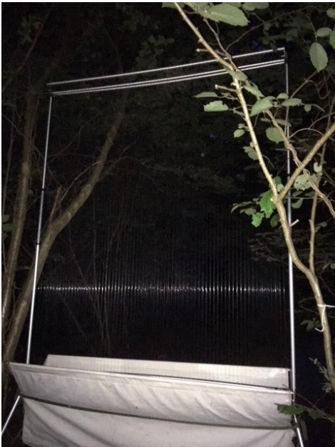
Epsom Common LNR a harp Trap being used for the woodland bat survey may 2017