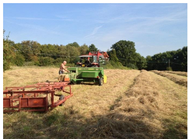
Horton Country Park LNR hay making in Little Westcotts summer 2014