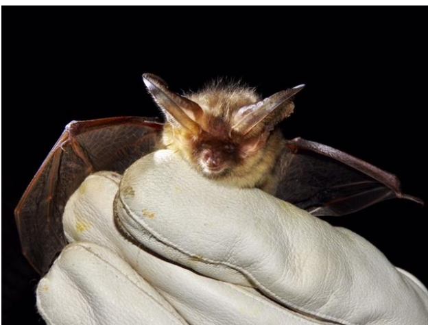
Epsom Common LNR a captured Brown Long Eared bat about to be released during the woodland bat survey may 2017