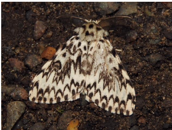
Horton Country Park LNR, Black Arches moth ( Lymantria monacha ) summer 2017

out on Horton Country Park LNR including a separate survey for leaf mine moths during 2017, which revealed 128 species of smaller moths and a grand total of 195 moth species recorded in what was a very short session. The surveys have found two nationally scarce species the Dotted Fan Foot ( macrochilo cribrumalis ) and ( Elegia Similella ), along with an abundance of orchard species resulting from the 2017 survey being carried out in Lambert's Orchard. Some spectacular moths from 2017 are pictured below. Further surveys are planned for 2018.