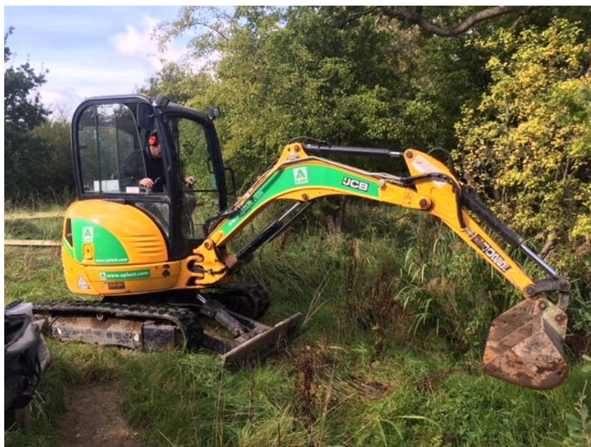
Lower Mole Partnership about to begin work to desilt Field Pond in Horton Country Park LNR September 2017

New: During September 2017 'Field Pond' in Horton Country Park LNR was part de-silted by the Lower Mole Partnership using funds provided by the Lower Mole Trust and Friends of Horton Country Park. In recent years 'Field Pond' has been successfully protected from dogs by a fence (See report under Objective 4) and EEBC Countryside Team volunteers have cut back over shading vegetation in preparation for de-silting. The pond is being closely monitored and the expectation is that its spectacular revival of recent years will be consolidated.