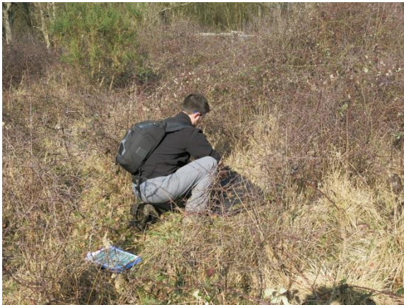
Checking a refuge on Epsom Common LNR

that Epsom Common is a very important site for Adders and there is a very widespread distribution of Grass Snakes.