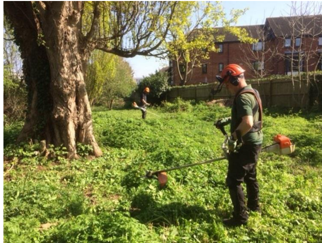
Stones Road SSSI Lower Mole Partnership volunteers clearing around the soon to be felled Lombardy poplars 2017

Update:- The Lower Mole Partnership has continued during 2017 to manage the SSSI using funds provided by Surrey County Council. For example, during 2017 under advice from Natural England the Partnership arranged for Surrey County Council to have four large Lombardy Poplars felled that were over shading the pond.