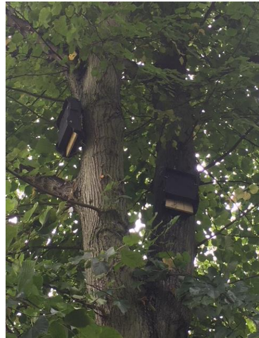
New bat boxes being installed in Rosebery Park, Epsom summer 2017