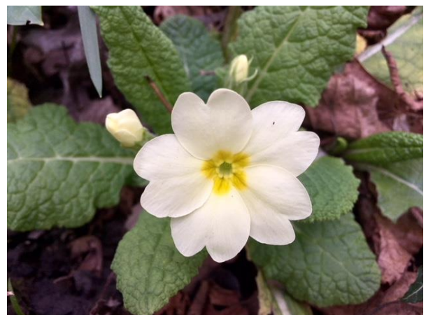
Butcher's Grove in Horton Country Park LNR, Primroses are returning as a result of coppicing! March 2017