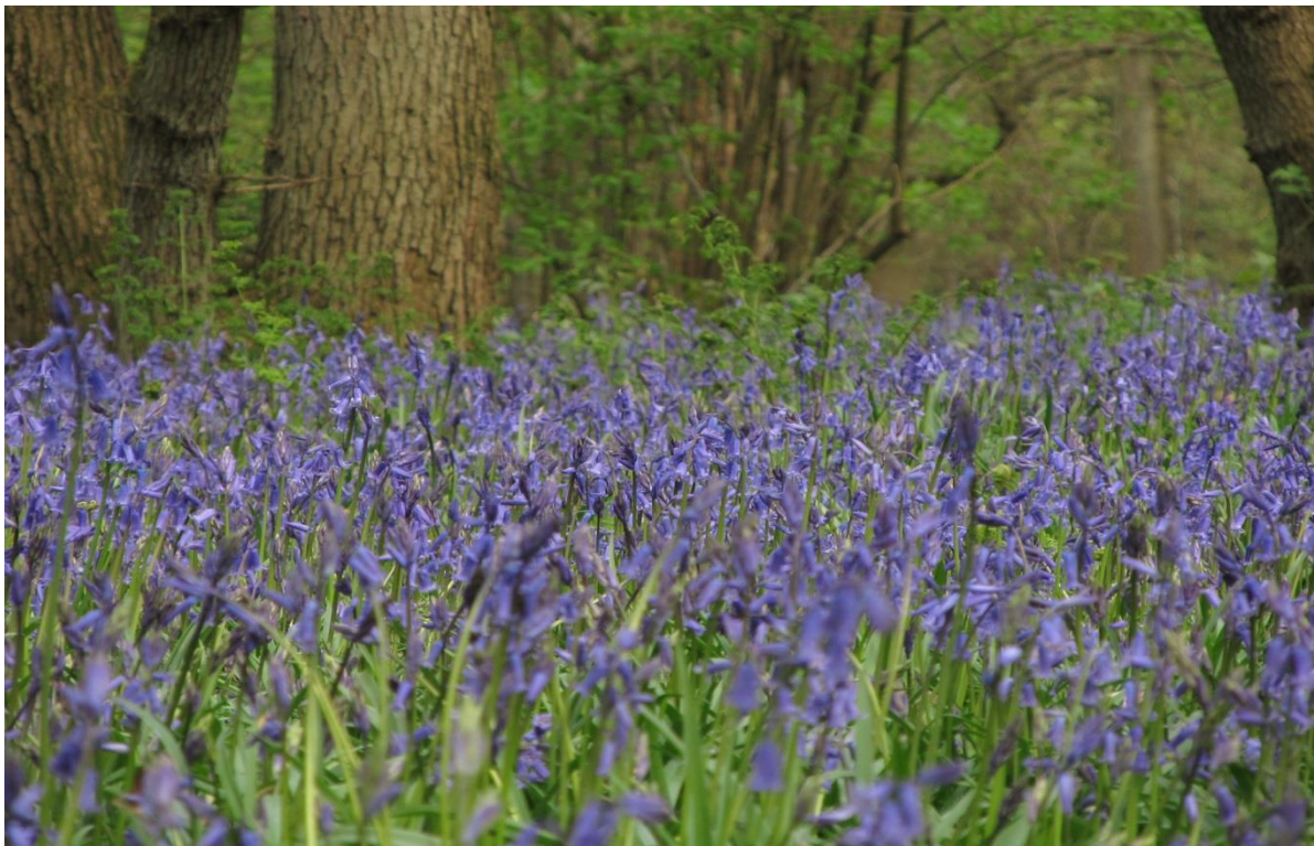
Pond Wood in Horton Country Park Local Nature Reserve, designated 'Ancient Woodland', SNCI and part of a Surrey Woodland BOA

Update:- During 2017 the Surrey Local Nature Partnership (SNP)-Biodiversity Working Group continued in its role of assisting the SNP board with identifying biodiversity priorities and to promote better coordination of biodiversity initiatives across the County. EEBC are represented on the Group. Priorities for the working group are how best to achieve the governments 'Biodiversity 2020' targets, formal adoption and revision of Biodiversity Opportunity Areas (BOA's), revision of criteria and formalising the process of designating Sites of Nature Conservation Importance (SNCI) and supporting volunteer recording efforts across the County. Following the production by Surrey Wildlife Trust of BOA's policy statements in 2015, the working group has been investigating ways of implementing a delivery strategy for BOA's, which in Epsom & Ewell includes woodland and a chalk grassland BOA. BOA are recognised in EEBC planning policy and the policy statements are set to play a role in defining the Boroughs forthcoming 'Green Infrastructure' policy.