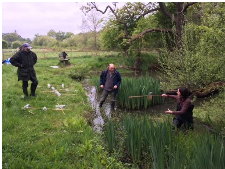
Horton Country Park LNR Field Pond surveying for Great Crested Newts spring 2017

Update:- In 2014 this report highlighted the need to protect the ecology of a pond in Horton Country Park LNR from constant daily disturbance by dogs. 'Field Pond' which is used for pond dipping had become a shadow of its former self with very few aquatic species able to tolerate the constant daily disturbance. Using a small grant from a local County Councillor the pond was fenced by the Lower Mole Partnership volunteers and a new notice was placed on the gate leading to the pond, explaining the need for dog owners to stop their pets entering the pond. During the summers of 2015, 2016 and 2017 a pond dip for a local Beaver Group discovered an astonishing recovery with the return and much greater abundance of aquatic life. The notice is still in place after a three years which is very positive and an indication that visitors are willing to help address the issue of long term incremental damage to habitats on nature reserves due to public access.