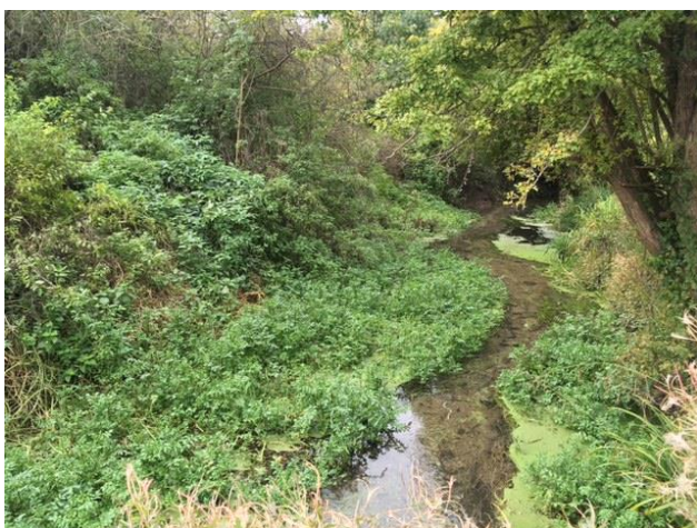
Hogsmill LNR photo taken Autumn 2016 showing natural berm that has formed following Countryside Team volunteers opening up the overgrown banks of the Hogsmill River in autumn 2015