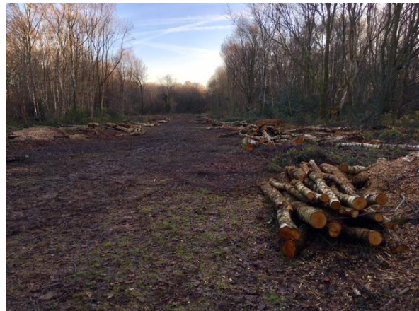
The extensive programme of woodland edge habitat creation and management is all paid for using externally sourced funds. Summer horse ride Epsom Common LNR winter 2017

Update:- In 2013 and 2015 the Lower Mole Partnership volunteers successfully de-silted Lambert's Pond in Horton Country Park Local Nature Reserve, revealing a long lost arm. During 2016 nature has rapidly begun to recolonise the pond and surveys will be carried out in 2017.