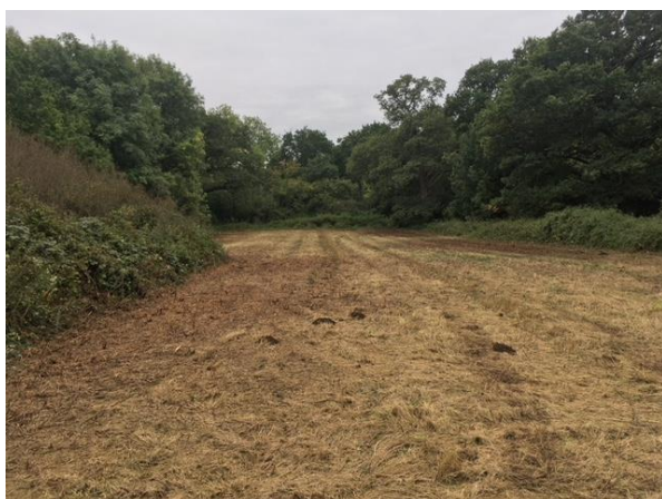
Horton Country park LNR Burnham's Grove part cut and cleared autumn 2017

At Horton Country Park LNR a hay crop continues to be taken in cooperation with the Equus Equestrian Centre. Flower rich meadows have declined by 97% since the 1930's making the hay meadows in the Country Park an unusual and special sight.