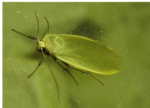
Horton Country Park LNR Dingy Footman moth ( Eilema griseola ) summer 2017

Update:- The project to monitor reptiles on Epsom Common Local Nature Reserve set up between the Countryside Team and the Surrey Amphibian and Reptile Group (SARG) continued during 2017. Results again confirm