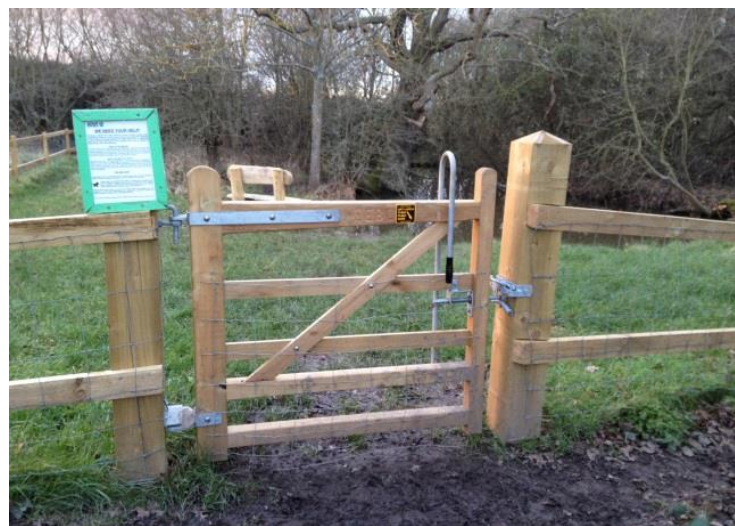
Horton Country Park LNR Field Pond gate, fence and notice Page 46