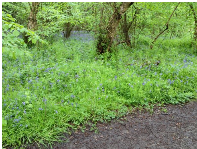
Horton Country Park LNR Pond Wood, photograph shows bluebells receding from the path edge with the much loved carpet of bluebells now some distance from the path spring 2014

Some of our open spaces in Epsom & Ewell are showing signs of strain due to high visitor numbers with woodland wildflowers and aquatic life in ponds under pressure from constant daily disturbance as described above.