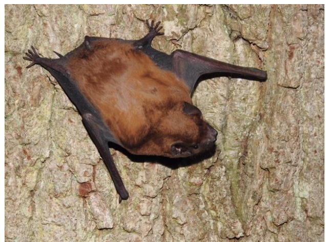
Epsom Common LNR a captured Noctule bat just released during the woodland bat survey may 2017