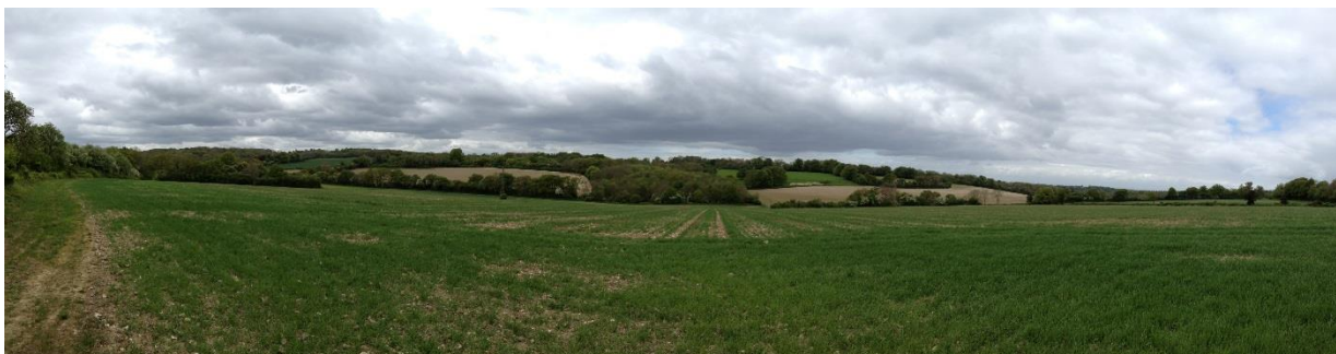
View across Langley Bottom Farm

Update:- During 2014 the Woodland Trust purchased a very large area of land at Langley Bottom Farm to create a First World War memorial woodland. This is a major initiative for the Trust who now have a memorial wood in England, Scotland, Wales and Northern Ireland. The farm is partly in the Boroughs/Districts of Epsom & Ewell, Mole Valley and Reigate & Banstead. The initiative will protect and hopefully enhance the biodiversity of this land in perpetuity. The Trust has held public consultation events for local residents and has consulted with EEBC and neighbouring districts. In 2015 the Trust were informed by the Forestry Commission that an Environmental Impact Assessment (EIA) was required due the scale of the tree planting proposals. Similarly an EIA has also been requested by the three district planning authorities (Epsom & Ewell, Mole Valley and Reigate & Banstead) for the car parking and visitor centre proposal. Following the successful completion of the EIA the Trust recommenced tree planting in 2017 following guidelines that ensure a balance is maintained between new woodland and areas retained as either arable fields to conserve rare arable plants and bird nesting habitat or grazed fields to conserve calcareous grassland.