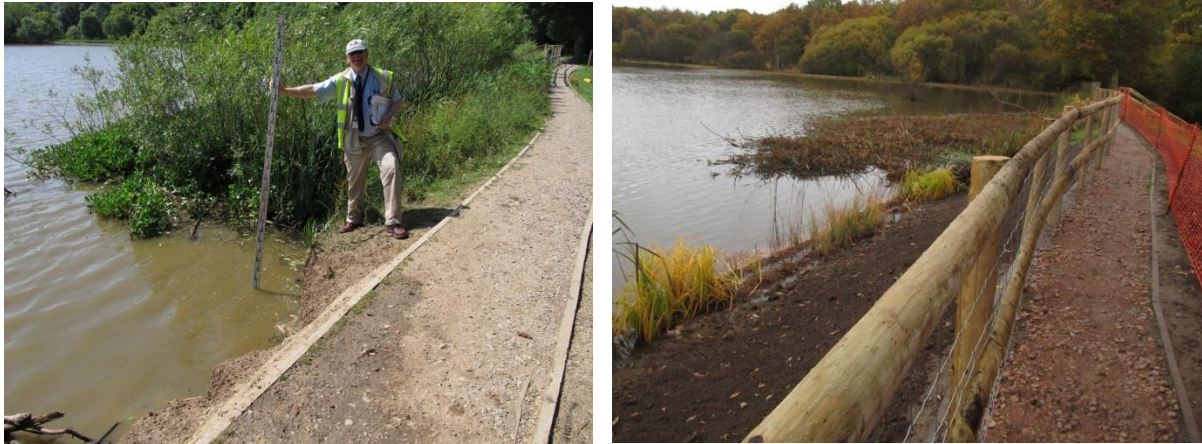
Erosion damage to the dam of Great Pond on Epsom Common LNR caused by dogs. Autumn 2012 repairs cost £18500

A recent example of the actual costs that can accrue was the need to restore Great Pond Dam on Epsom Common in 2012 as illustrated in the photos below, due to erosion caused by dogs entering the pond.