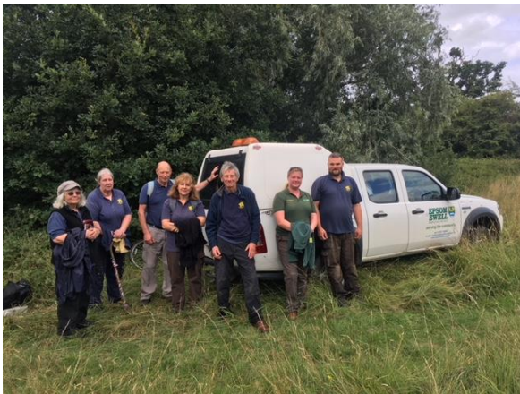
Tools and equipment used by the Countryside Team volunteers are paid for and maintained using externally sourced funds. Photo taken August 2017

Update:- Currently externally sourced funding is in place helping deliver management of biodiversity for both Epsom Common and Horton Country Park Local Nature Reserves until 2020. The key source is the 2010-2020 Environmental Stewardship Higher Level Scheme, along with the new Countryside Stewardship Basic Payments Scheme which is the successor to the European Single Farm Payments Scheme.