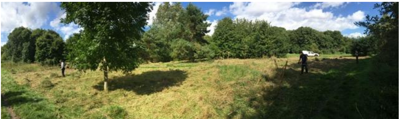
Hogsmill LNR Countryside Team volunteers clearing rough grassland and encroaching scrub near Chamber Mead summer 2017

Update:- Work to conserve and enhance rough grassland in Horton Country Park LNR and the Hogsmill LNR has been taking place since 2008 using a rotational approach which prevents the grassland disappearing under encroaching scrub. 2017 saw the continuation of this vital habitat maintenance work carried out by both volunteers in the most sensitive areas (Ant Hills) and by an EEBC tractor using a hired flail collector.