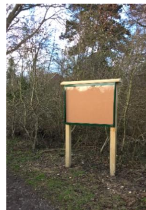
Horton Country Park LNR new information board installed by Lower Mole Partnership volunteer's autumn 2017