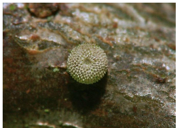
Tiny (size of a pin head) Brown Hairstreak butterfly egg laid on young Blackthorn Stem in Horton Country Park LNR