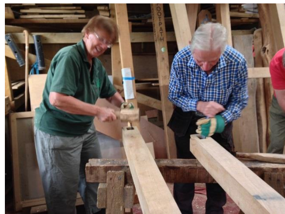
Volunteers from the Lower Mole Partnership in the workshop at Horton Country Park LNR making sign posts 2017