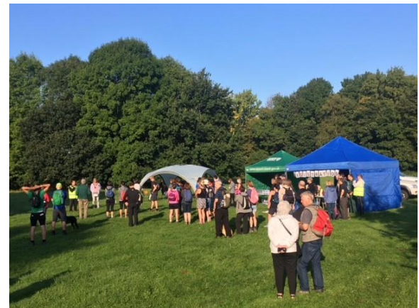
Horton Country Park LNR hikers about to set off on the 20 mile Round the Borough Hike event September 2017