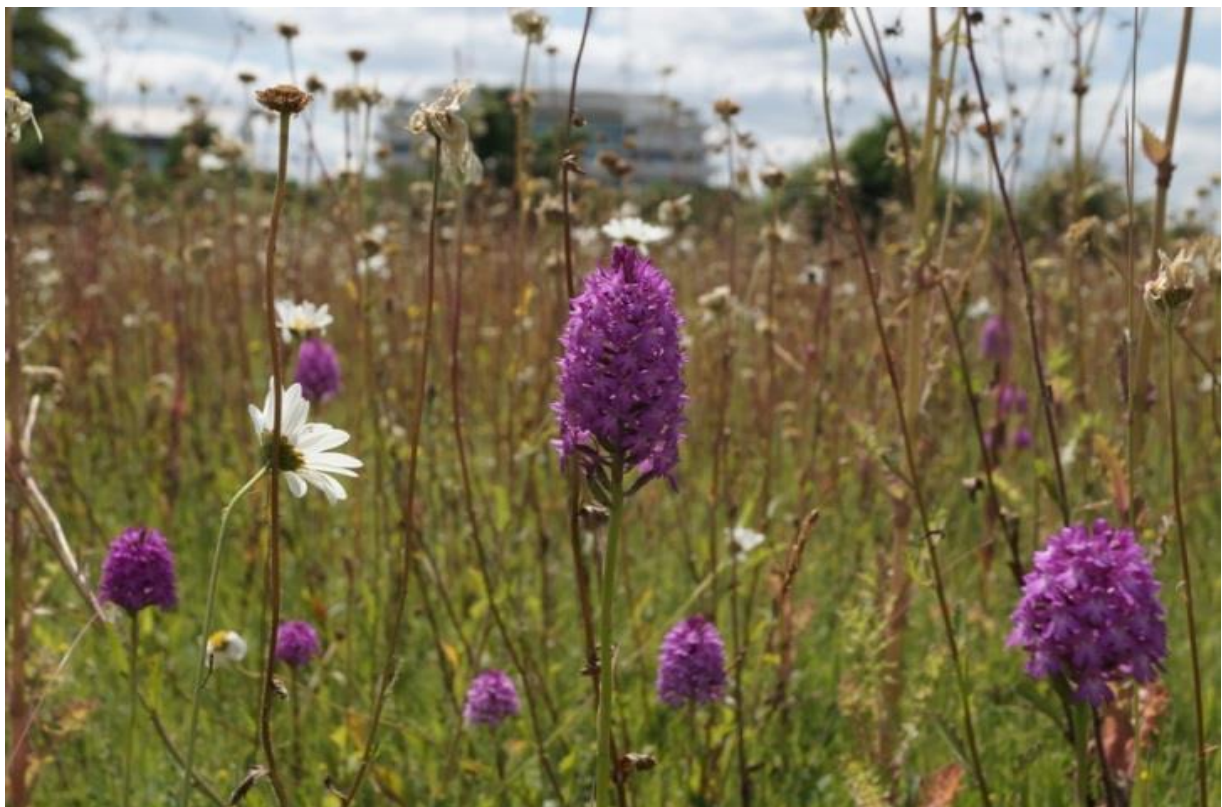
Pyramidal Orchids at the Thames Water site with Queens Stand in the background summer 2014

Update:- In 2017 the Borough still has the highest proportion of Sites of Nature Conservation Importance (SNCI) in active management in Surrey. The government's 'Single Data Set' uses the measure of SNCI in active conservation management to monitor the current condition of the nation's biodiversity. The Borough currently has 13 SNCI with 10 currently under active conservation management giving Epsom & Ewell the highest score in Surrey, 77% (Average 44%). During 2015 the "Local Sites" committee designated two new SNCI in Epsom & Ewell. These are the small Thames Water covered reservoir site on Epsom Downs where a site visit in summer 2014 discovered the presence of the Small Blue Butterfly, along with several species of orchid. Langley Bottom Farm now owned by the Woodland Trust was also designated with approximately one third of the farm located in Epsom & Ewell. The farm is of particular note for its arable plants and also includes 'Ancient' Woodland.