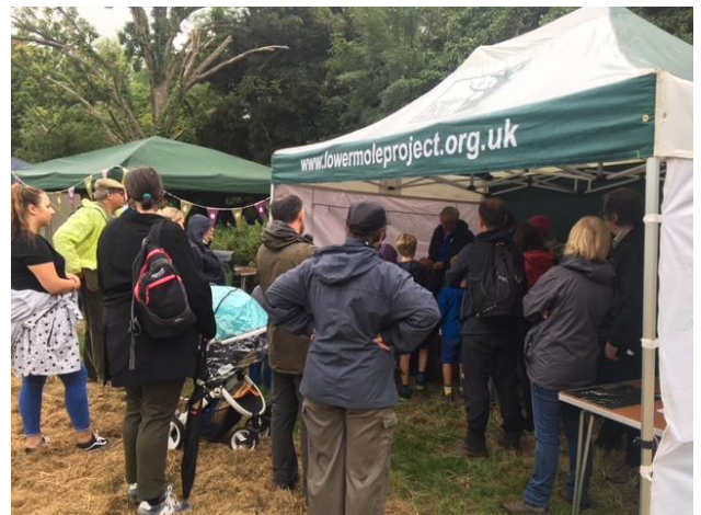
Horton Country Park LNR members of the public watching local moth expert Paul Wheeler reveal and release the moths caught the evening before the bio blitz July 2017