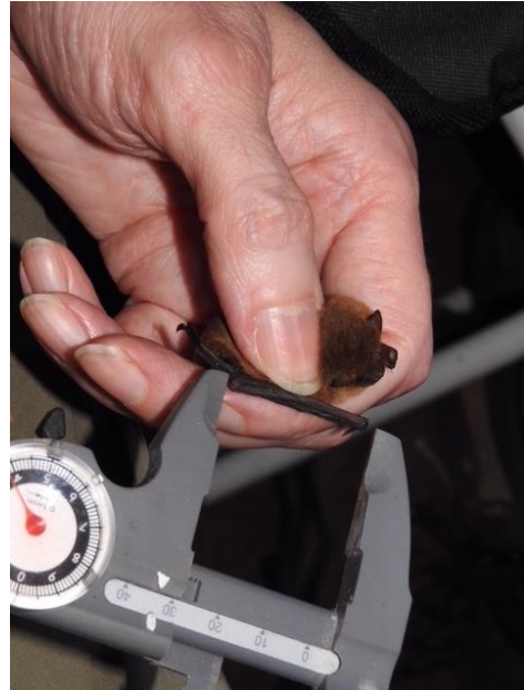
Epsom Common LNR a captured pipistrelle bat being measured during the woodland bat survey may 2017