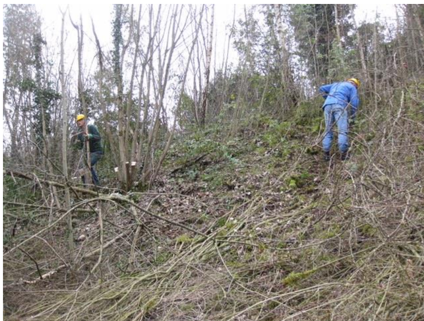
Epsom Downs Golf Course, volunteers from the Lower Mole Partnership clearing scrub to conserve chalk grassland later

Update:- During 2017 further work to conserve chalk grassland was carried out by volunteers from the Lower Mole Countryside Partnership with clearance of scrub on Epsom Downs golf course, helping conserve flower rich chalk grassland including Kidney Vetch the food plant of the scarce Small Blue Butterfly.