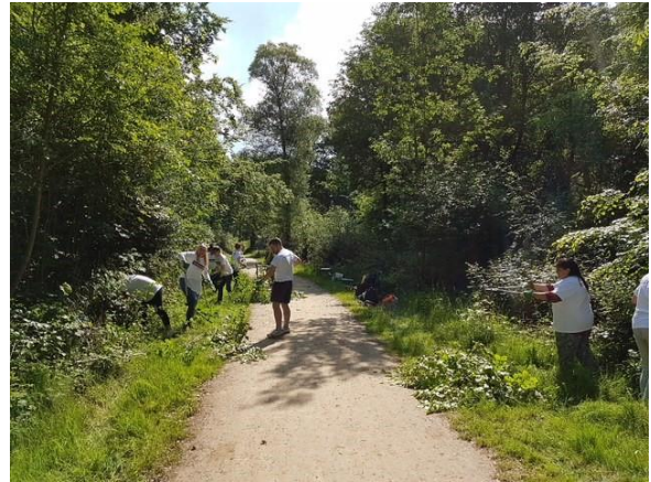
Epsom Common LNR a Lower Mole Partnership supervised corporate working party helping manage woodland edge habitat summer 2017