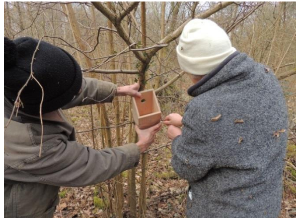
Volunteers positioning Dormouse boxes on Epsom Common LNR winter 2013/14