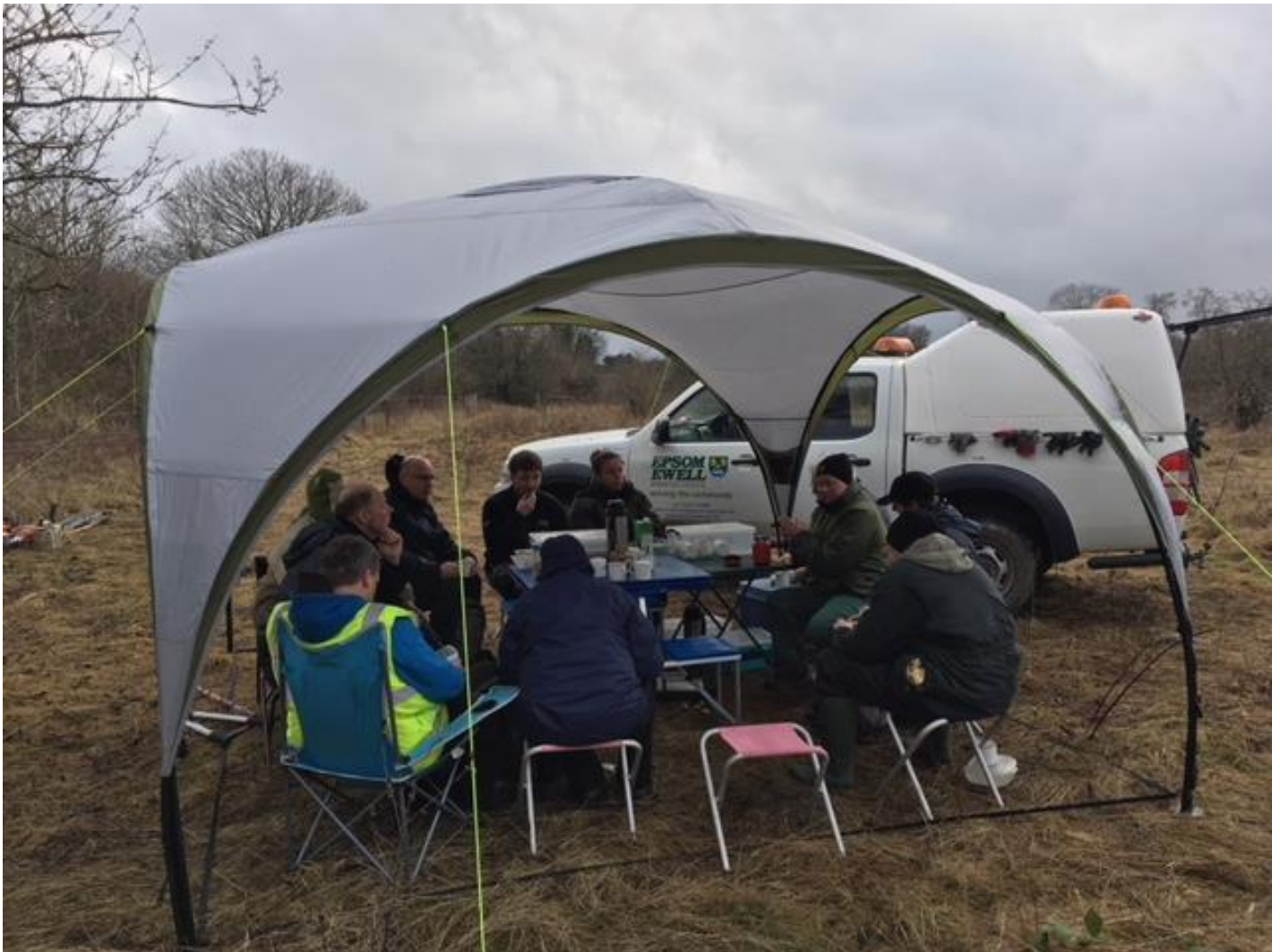
Countryside Team Volunteers enjoying a well-earned break on a very cold and wet Priest Hill January 2017

Update:- In 2014 the new Surrey Wildlife Trust (SWT) Nature Reserve and SNCI at Priest Hill was opened, representing a huge gain for biodiversity in the Borough. The reserve was set up following negotiations between the Developer, EEBC and SWT and allowed for a small number of houses to be built on 'Green Belt' whilst protecting the vast majority of the land in perpetuity through the creation of the nature reserve which SWT have agreed to take on and manage. In January 2017 following on from 2015 & 16 the EEBC Countryside Team volunteers assisted SWT Ranger Rachael Thornley by clearing scrub. In addition SWT applied for planning permission for an enlarged pond on the reserve in 2017, conservation grazing using cattle is now well established.