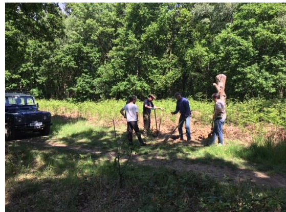
Lower Mole Partnership volunteers installing a memorial bench on Epsom Common LNR summer 2017