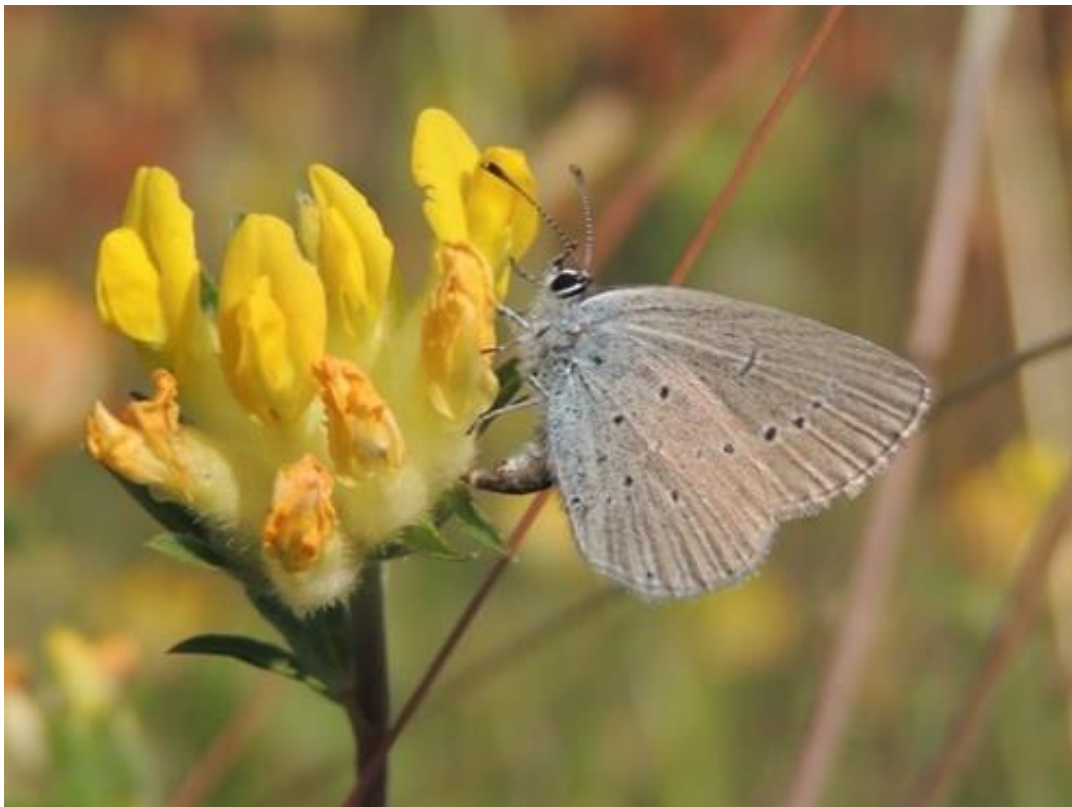
Howell Hill Nature Reserve, Small Blue Butterfly laying an egg on Kidney Vetch

The Small Blue butterfly continues to benefit from creating scrapes which involves using a small excavator to remove top soil and expose the less fertile chalky substrate which encourages the growth of Kidney Vetch, the larval food plant for the butterfly. In addition at their new Priest Hill nature Reserve, Surrey Wildlife Trust have also been creating suitable habitat by removing the tarmac from former tennis courts and spreading Kidney Vetch seed from nearby Howell Hill Nature Reserve on the exposed chalk. With known breeding populations identified at Warren Farm, Howell Hill Nature Reserve and Epsom Downs it was hoped that the Small Blue would colonise the Priest Hill scrapes. During the summer of 2015 Small Blue were discovered on the reserve. SUCCESS!