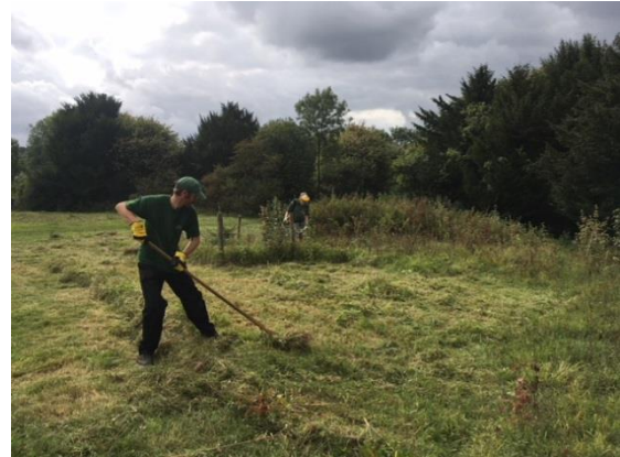
Juniper Hill, Epsom Downs chalk grassland management summer 2017

Update:- During 2017 further work to conserve chalk grassland was carried out by volunteers from the Lower Mole Countryside Partnership with clearance of scrub on Epsom Downs golf course, helping conserve flower rich chalk grassland including Kidney Vetch the food plant of the scarce Small Blue Butterfly.