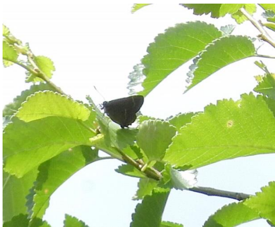
A very difficult to photograph White Letter Hairstreak butterfly resting in the canopy of a large English Elm in the Hogsmill LNR summer 2016

In 2017 butterfly numbers were significantly up compared to 2016 but number of species sighted saw a small decline. For example, on Epsom Common LNR in 2015 recorders had 950 sightings of 24 species, whilst in 2016 there were only 473 sightings of 25 species. In 2017 there were 829 sightings of 22 species. Juniper Hill on Epsom Downs had 29 species recorded indicating the importance of calcareous grassland to any butterfly species. During 2017 volunteer efforts coordinated by Butterfly Conservation focused again on the White Letter Hairstreak and sightings have continued to increase as more Elm trees have been discovered. The magnificent Purple Emperor was spotted again in 2017 on Epsom Common LNR and volunteers have spotted Brown Hairstreak eggs laid on young Blackthorn stems in a number of locations in Horton Country Park and Hogsmill Local Nature Reserves.