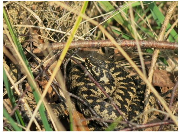
Adder on Epsom Common LNR

Update:- The Countryside Team and volunteers continued to monitor butterflies on a weekly basis over the summer using agreed transects and submitting records to the national database for Epsom Common LNR, Horton Country Park LNR, Hogsmill LNR, Nonsuch Park, Howell Hill Nature Reserve and Juniper Hill. 2017 has turned out to be an average year with a warm spring bringing an early start but a damp end of July and August affected some species.