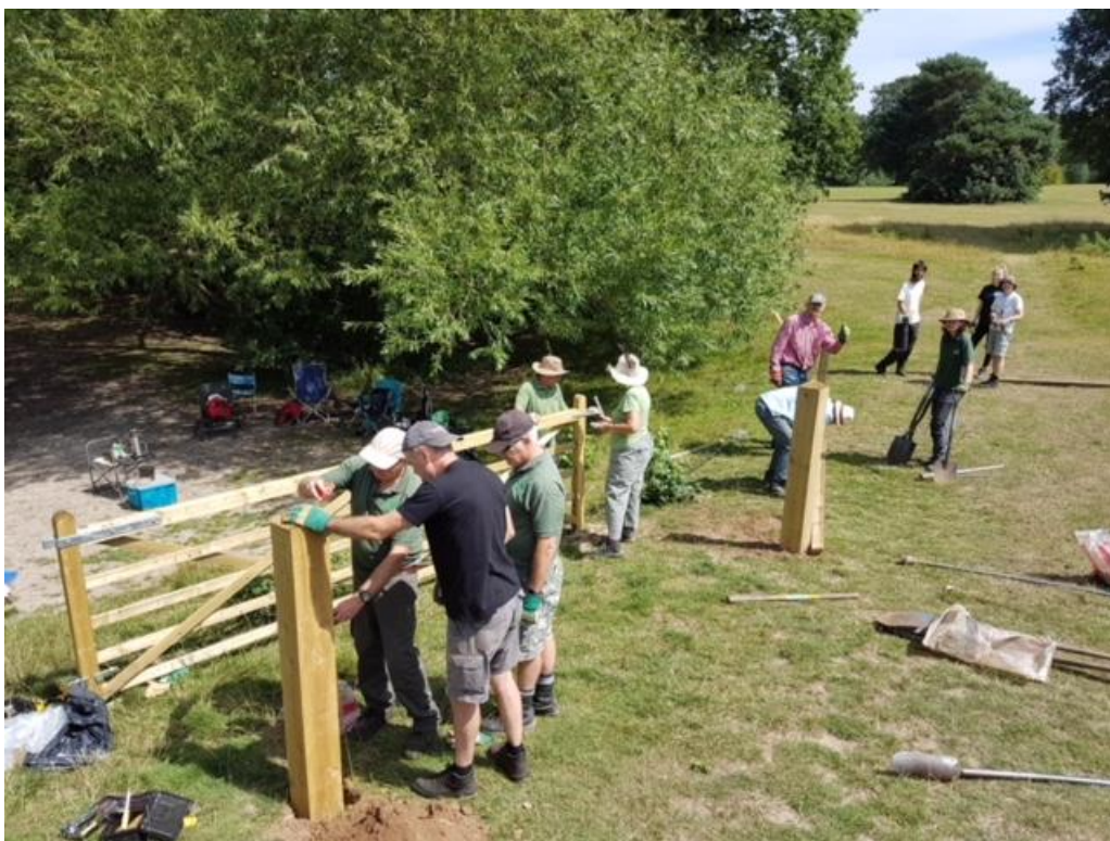
Nonsuch Park Lower Mole Partnership volunteers building a fence to protect Round Pond from dogs July 2017

New: During 2017 the Lower Mole Partnership carried out more work to help conserve 'Round Pond' in Nonsuch Park which like 'Field Pond' in Horton Country Park LNR was being affected by both over shading vegetation and dogs. A new fence has been constructed using donations and a grant from the Lower Mole Trust. The pond will be closely monitored over the next few years to record its recovery.