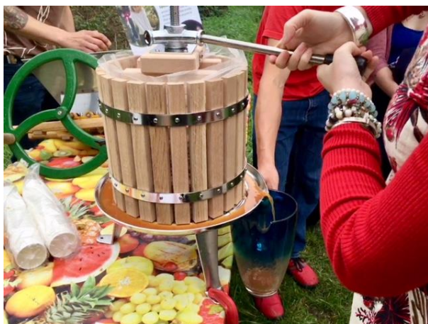
Horton Country Park LNR the apple and pear press in action during Apple Day October 2017