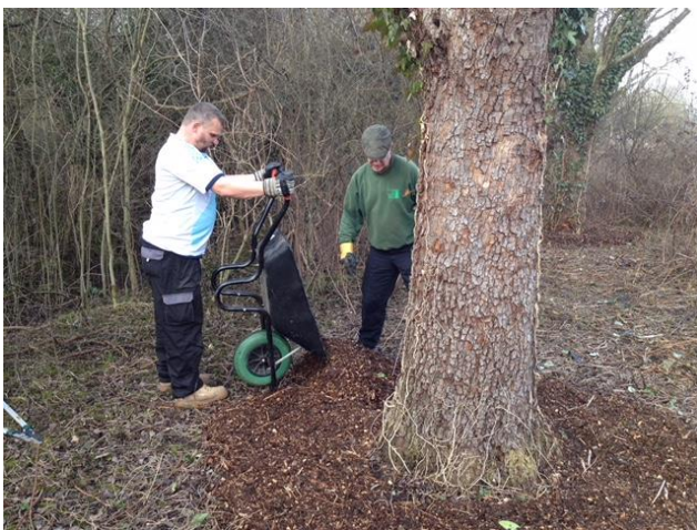
Horton Country Park LNR in Lambert's Orchard EEBC Countryside team and Lower Mole Partnership volunteer's applying a woodchip mulch to the base of a pear tree in Lambert's Orchard February 2017

Update:- Since the 1960's more than 90% of orchards have been lost in England. During 2012/2013 EEBC worked with the London Orchard Trust (Now called the Orchard Trust) to restore two orchards in Horton Country Park LNR both formerly within the Long Grove Hospital Grounds. 2017 has been a very active year! Volunteer effort focused on clearing encroaching scrub from around some of the old apple and pear trees in Lambert's Orchard and feeding the trees with a mulch of surplus wood chips provided by the Borough's tree contractor ATS Tree Services. In addition the EEBC Countryside Team worked with the Orchard Trust to provide volunteer training.