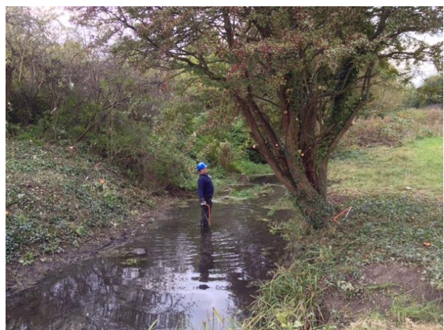
Hogsmill LNR same location as photo opposite taken in autumn 2015 at the end of the task showing clearly what a big difference managing bankside vegetation can make!