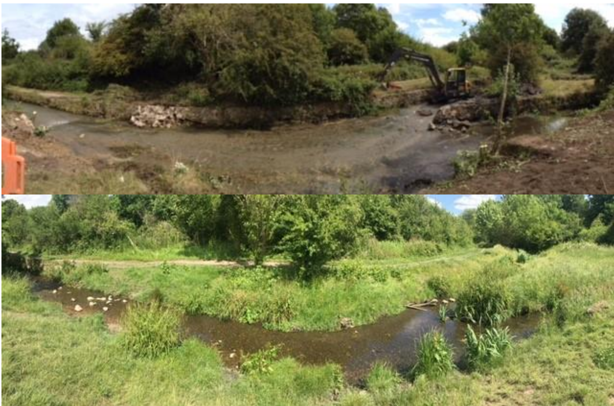
Hogsmill LNR, confluence of the Hogsmill River and Green lanes Stream shown in August 2014 with work commencing to remove walled banks and concrete bed and the naturalised banks and bed in June 2017

During 2016 and 2017 as a catchment partnership priority SERT worked with the Environment agency and Thames water to monitor both the Epsom and Ewell 'Storm tanks' which are designed to manage raw sewage during periods of high rainfall. The monitoring indicated that discharges of raw sewage in to the Hogsmill River are quite frequent and the Catchment Partnership have indicated a desire to work towards a long term solution that reduces or ideally prevents any raw sewage being discharged. The Hogsmill Catchment Partnership has also identified and prioritised a potential project to create a wetland at Chamber Mead in the Hogsmill Local Nature Reserve and it is hoped that funds can be secured during 2018 for what would be a major biodiversity enhancement that would build on the projects of recent years such as weir removal and naturalising the river channel and banks.