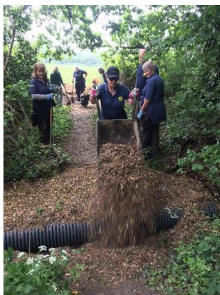
EEBC Countryside Team Volunteers constructing a wood chip path in Horton Country Park LNR spring 2017

Update:- Managing public access plays a very important role in protecting fragile habitats especially on busy urban fringe sites like Epsom Common LNR and Horton Country Park LNR. For example, the provision of good quality footpaths and bridleways helps to protect the nationally and internationally important wildlife on the Epsom & Ashted Common Site of Special Scientific Interest. During 2017 Lower Mole Partnership volunteers constructed and installed two new information boards in Horton Country Park LNR, extended the ditch alongside the recently restored path on Epsom Common to help protect the new path surface and constructed and installed a new memorial bench donated by a member of the public. The continued creation of woodland edge habitat on Epsom Common has brought both ecological benefits but also made for a much more open and safer feeling experience for visitors. New benches and information boards alongside paths on the Hogsmill Local Nature Reserve help encourage residents to use the reserve and get closer to nature.