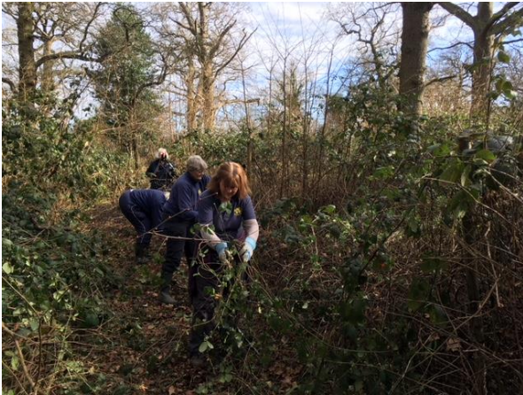
Four Acre Wood in Horton Country Park LNR EEBC Countryside Team volunteers dismantling deer fencing winter 2017