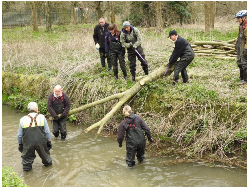
Volunteers from the South East Rivers Trust using tree branches to help restore the Hogsmill River March 2016

photos below. The major work carried out in 2013 and 2014 to remove two large weirs from the Hogsmill River in Epsom & Ewell and remove the concrete bed and walls at the confluence where the Green Lanes Stream joins the Hogsmill River continues to naturalise. Further significant improvements are being discussed/planned via the Hogsmill Catchment Partnership.