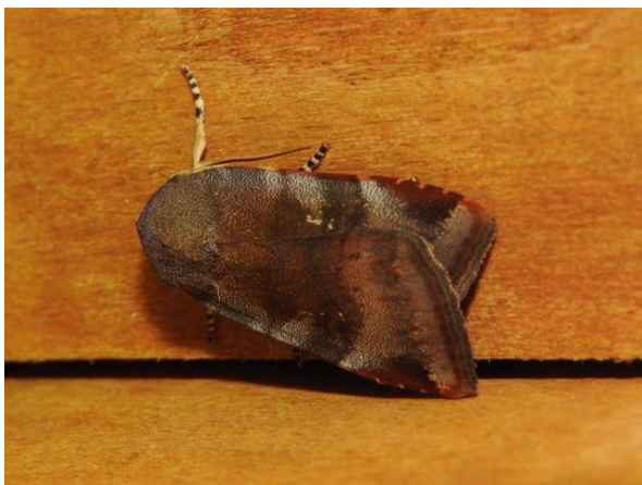
Horton Country Park LNR Lesser yellow Underwing moth ( Noctua comes ) summer 2017