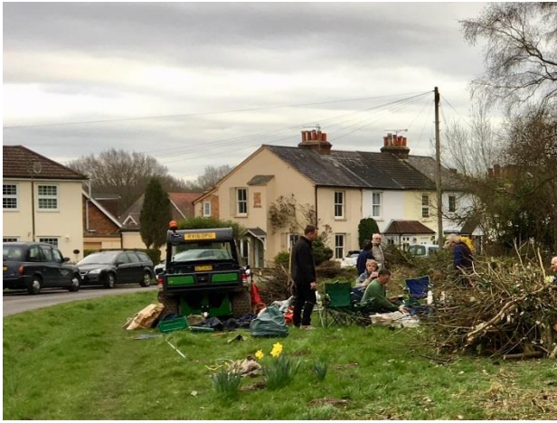
Epsom Common Association ECOVOLS working with residents in Bramble Walk to manage scrub on Epsom Common LNR March 2017