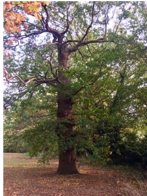
Veteran Oak discovered in Mounthill Gardens park, Epsom October 2017

Update:- Woodland management at Horton Country Park LNR under the Environmental Stewardship Higher Level Scheme continued during 2016/2017 with volunteers coppicing a section of Sherwood Grove, planting hazel trees and erecting deer fencing in Butcher's Grove and also dismantling deer fencing in Four Acre Wood as previous coppice matures.