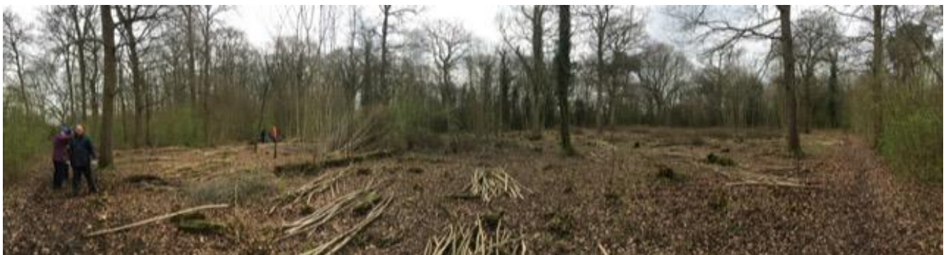
Butcher's Grove in Horton Country Park LNR, EEBC Countryside Team volunteers erecting deer fencing and planting hazel trees March 2017

Update:- Woodland management at Horton Country Park LNR under the Environmental Stewardship Higher Level Scheme continued during 2016/2017 with volunteers coppicing a section of Sherwood Grove, planting hazel trees and erecting deer fencing in Butcher's Grove and also dismantling deer fencing in Four Acre Wood as previous coppice matures.