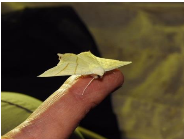
Horton Country Park LNR in Lambert's Orchard a Swallow-tailed Moth found on the evening before the bio blitz July 2017

New:- In 2017 the Countryside Team continued to work with the Orchard Trust and together organised a 'BioBlitz' in Lambert's Orchard in July and an Apple Day during October. Both these family events were well attended helping to raise awareness of the biodiversity value of orchards.