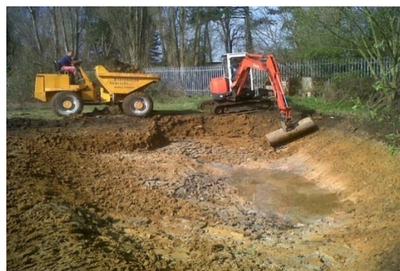
Lower Mole Countryside Management Project volunteers planting a hedge at Stones Road Allotment in 2012 and work to construct the new pond in 2013.