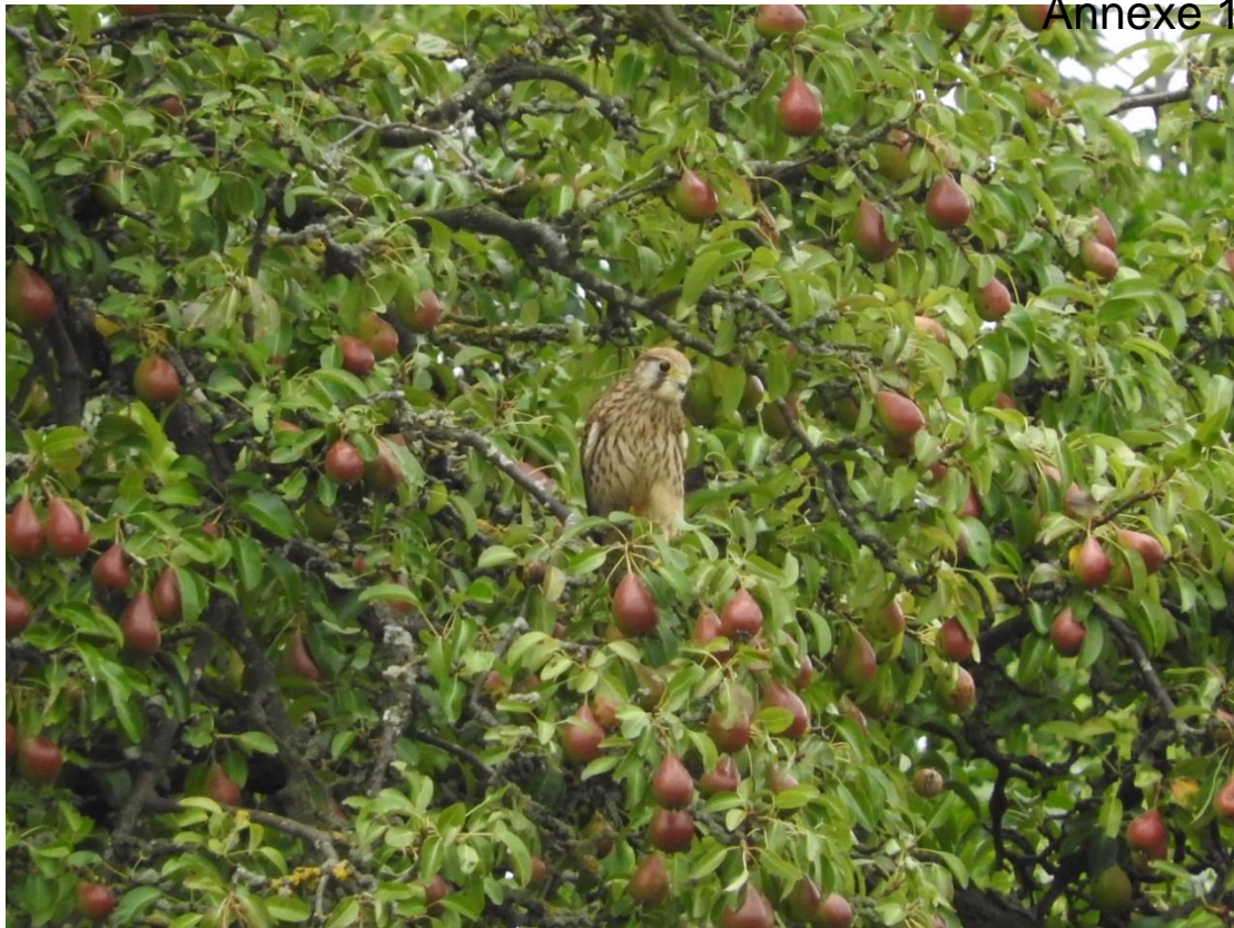
Horton Country Park LNR Lambert's Orchard where we don't have partridges but kestrel's in our pear trees! July 2017

New:- During Autumn 2017 as part of the on-going work to conserve the orchards in Horton Country park LNR an expert from the London Orchard Trust discovered a nationally rare fungus called the Orchard Toothcrust Fungus ( Sarcodonata crocea ) which though widespread has only been seen 32 times in the last 50 years! The find was featured in the Epsom Guardian Newspaper with the following article.