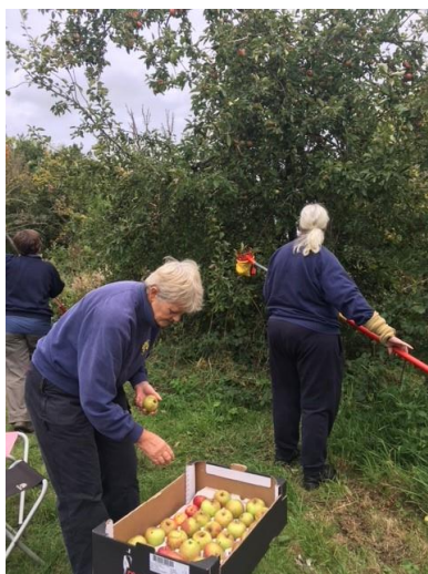
Horton Country Park LNR in Lambert's Orchard EEBC Countryside Team volunteers collecting apples for juicing before the Apple Day event autumn 2017