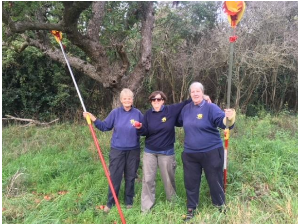
Countryside Team Volunteers collecting apples and pears for the Apple Day event autumn 2017

Update:- EEBC continues to raise awareness by encouraging active participation in site management. This is achieved through walks, talks, leaflets, the web site, regular weekly conservation tasks, through working with 'Friends Groups', local youth groups and support for the Lower Mole Countryside Partnership.