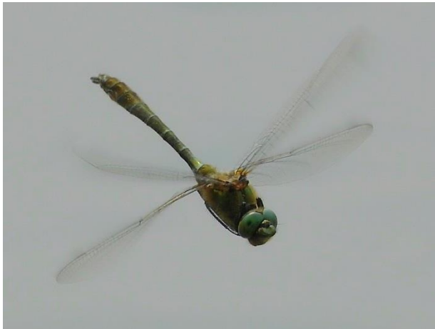
Epsom Common LNR a Downy Emerald dragonfly on the edge of great Pond May 2016

New:- During both 2016 and 2017 one nationally scarce dragonfly (Down Emerald) and one new and notable species of damselfly (White legged) were discovered on Epsom Common LNR. The Downy Emerald sighting was the first recorded since 1989 and the White legged damselfly does not appear to have been previously recorded. Both sightings indicate that on-going habitat is effective.