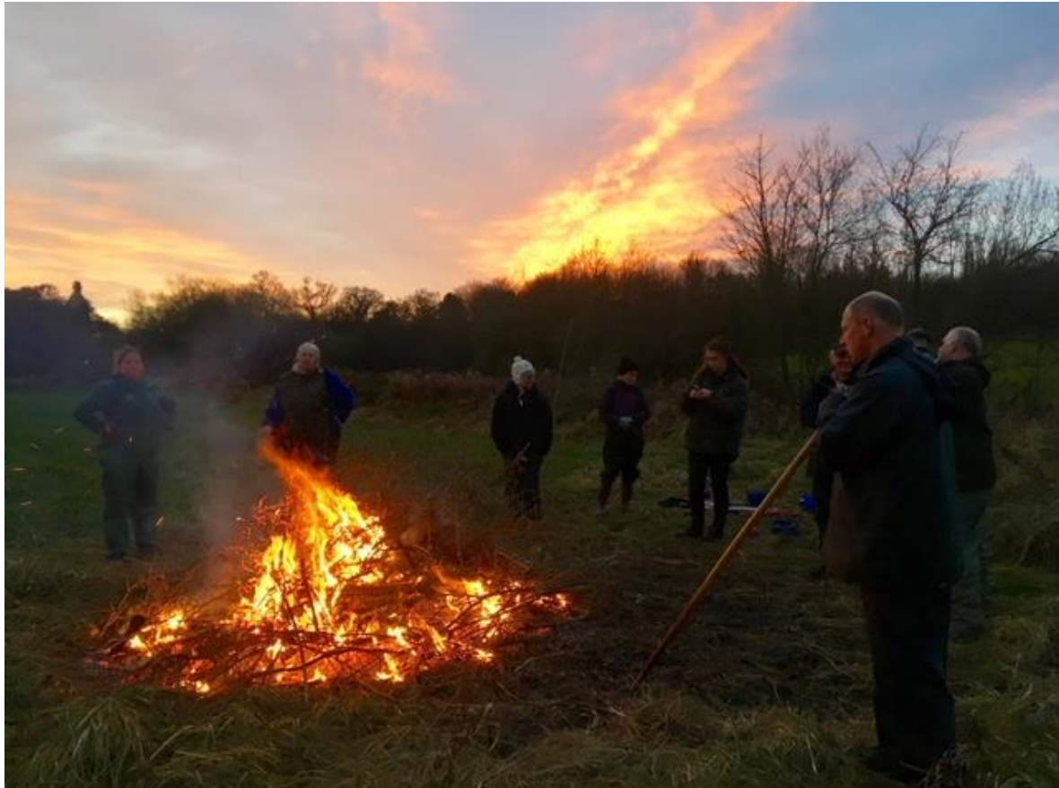
Horton Country Park LNR EEBC Countryside Team volunteers gather around the fire to enjoy the sunset at the end of task on a cold winter's day in November 2017

2017 has seen further progress in implementing the plan which continues to play a significant role in coordinating and guiding efforts to conserve and enhance biodiversity in the Borough. A BIG THANK YOU from the Working Group to all the volunteers who have helped conserve and enhance biodiversity in the Borough during 2017 in all weathers!